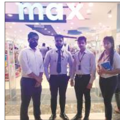
Visited MAX, Ghaziabad.