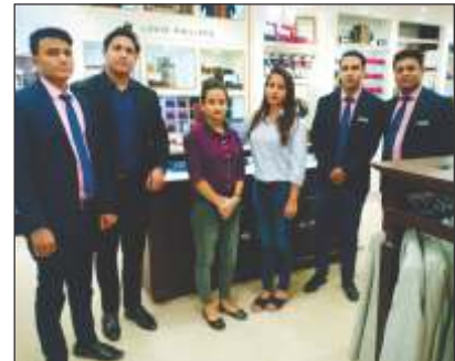
Visited Bombay Dyeing.