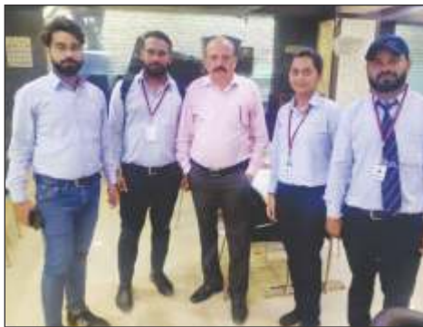
Visited Hotel Royal Inn.