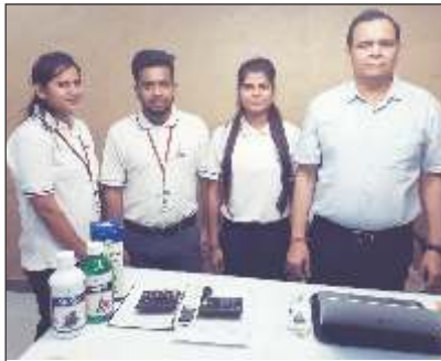
Visited "Crops Science Pvt. Ltd"

The marketing club conducted a market analysis of the mutual fund companies & financial services of non banking financial institutions. Thus in this regard, the students went to the Muthoot finance & Geogit financial services to get the knowledge about the services of these two companies. Their conversation with the branch manager helped them to know about the current market scenario of mutual funds & other financial services. Students worked on various live projects in many organizations, some glimpses of their efforts are following: