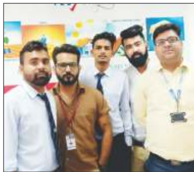
Visited YES Bank.