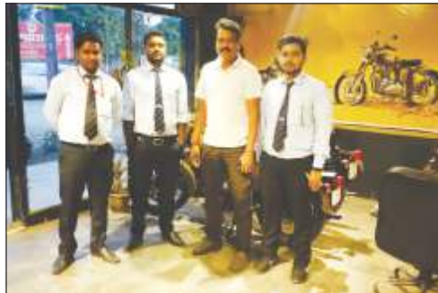
Visited Royal Enfield showroom.